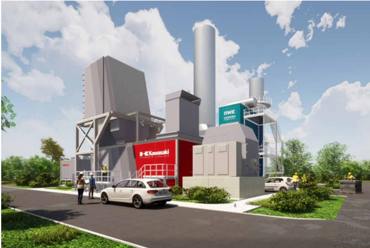
Hydrogen-to-Power Plant in Lingen

Tokyo and Lingen, December 9, 2021 — With the joint-demonstration project “H2GT-Lingen”, German energy company RWE Generation SE (RWE) and Japanese comprehensive heavy-industry manufacturer Kawasaki Heavy Industries (Kawasaki) are planning to install a hydrogen-fueled gas turbine based on renewable green hydrogen in Lingen, Germany. The gas turbine generator set “GPB300 / L30A” with an electrical power output of 34 MW el. will be used to reelectrify hydrogen. H2GT-Lingen will be one of the world’s first pilots to test 100% hydrogen-to-power conversion on an industrial scale turbine.